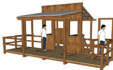
3D VIEW - FRONT NO SCALE