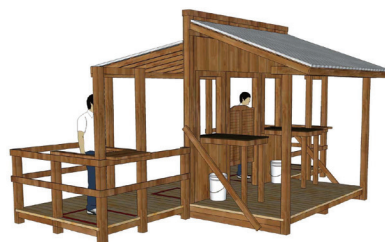
3D VIEW - REAR NO SCALE