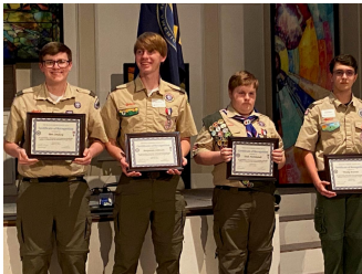
Reoesentatives of the Class of 2023 Eagle Scouts

At our Annual Council Recognition Dinner on April 16th, there were several noteworthy awards and recognitions made. We are so proud of our Class of 2023 Eagle Scouts and the volunteer leaders who deliver quality Scouting programs.