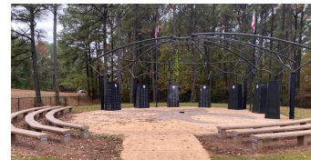
Eagle Plaza at the Leroy McAbee Scout Service Center 2700 Jack Warner Parkway NE Tuscaloosa, AL 35404