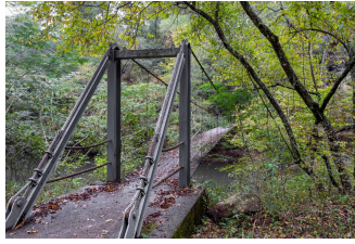
Camp O'Rear 2180 Curry Highway Jasper, AL 35501