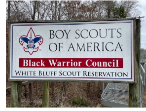
White Bluff Scout Reservation Located on Hwy 43, just north of Demopolis