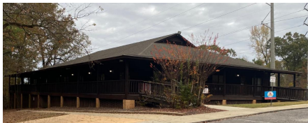
Board Room at the Leroy McAbee Scout Service Center 2700 Jack Warner Parkway NE Tuscaloosa, AL 35404