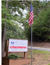
Camp Horne 13633 Keenes Mill Road Cottondale, AL 35453

Black Warrior Council 2700 Jack Warner Parkway, N.E. Tuscaloosa, AL 35404