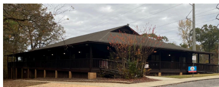
Board Room at the Leroy McAbee Scout Service Center 2700 Jack Warner Parkway NE