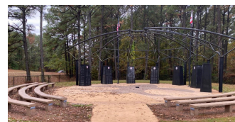
Eagle Plaza at the Leroy McAbee Scout Service Center 2700 Jack Warner Parkway NE Tuscaloosa, AL 35404