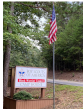
Camp Horne 13633 Keenes Mill Road Cottondale, AL 35453