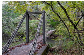
Camp O'Rear 2180 Curry Highway Jasper, AL 35501