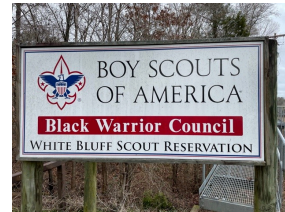
White Bluff Scout Reservation Located on Hwy 43, just north of Demopolis