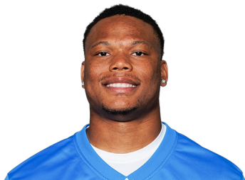
David Montgomery Running Back, Detroit Lions